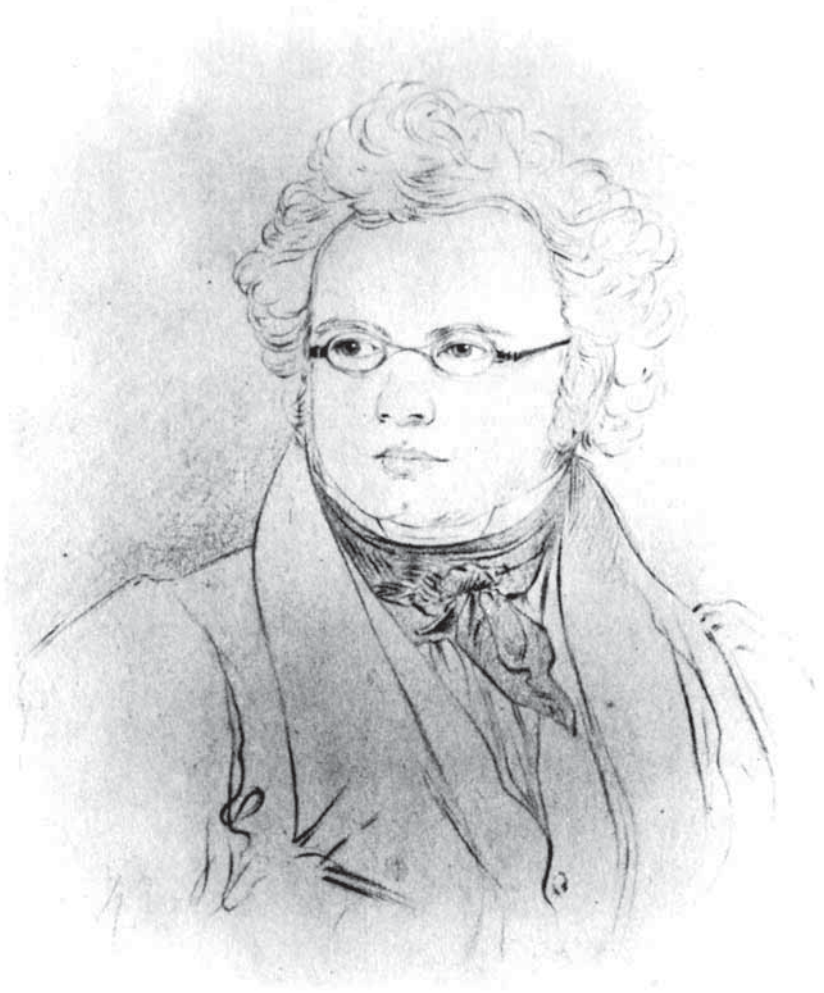
Drawing of Schubert from around 1825, by his friend and portrait artist Joseph Teltscher.