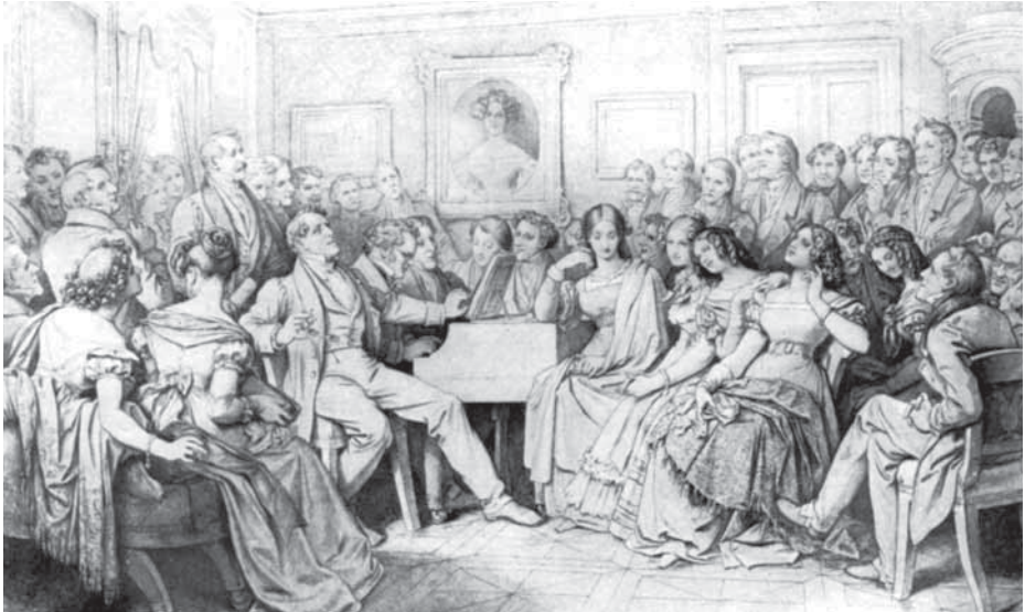
A Schubertiade, featuring Schubert on piano, the singer Vogl, and many other members of Schubert's circle, drawn by his friend Moritz von Schwind.

Like Mozart and Haydn before him, Schubert was born into a musical household where proficiency on a number of instruments was taken for granted. He played in the family string quartet alongside his father and elder brothers, and records from the Imperial College in Vienna, to which Schubert won a scholarship, show that he received tuition on both violin and piano. However, unlike his predecessors, he was not a virtuoso performer and therefore struggled to gain public exposure.